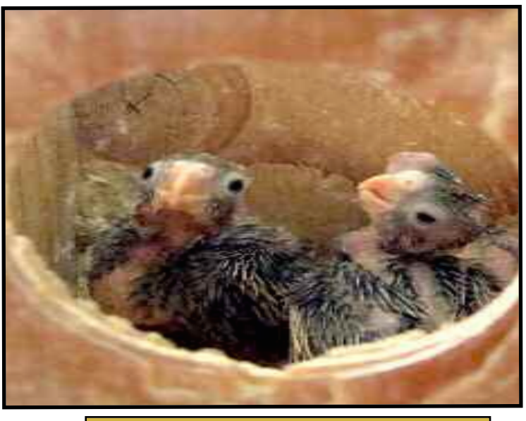
#1 Deadline June 15, 2021