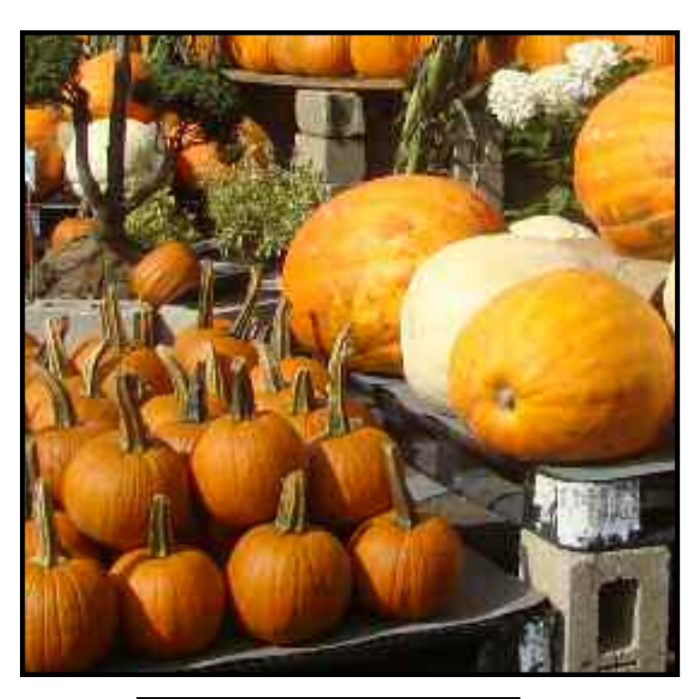
#5 Deadline November 15, 2021