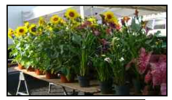
#2 Deadline July 15, 2021

We ask for poems that resonate with these photographs.