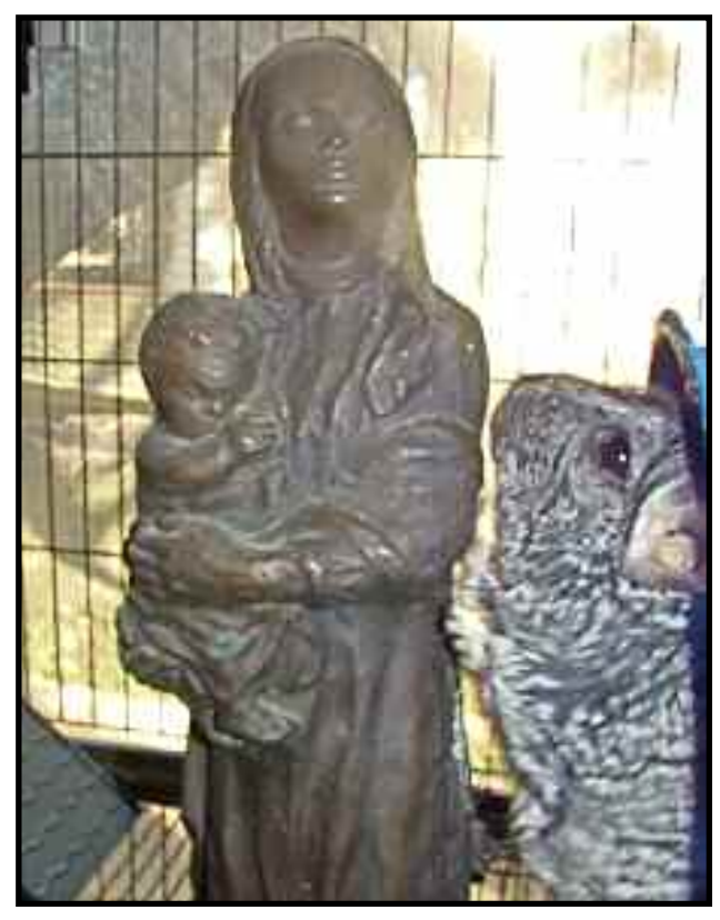
#6 Deadline December 15, 2021