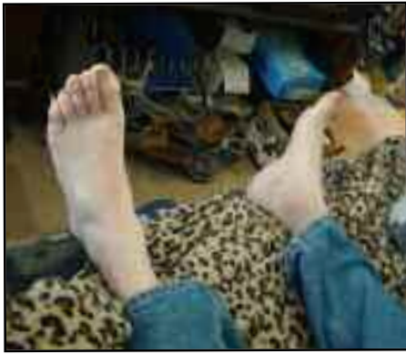
#7 Deadline January 15, 2022