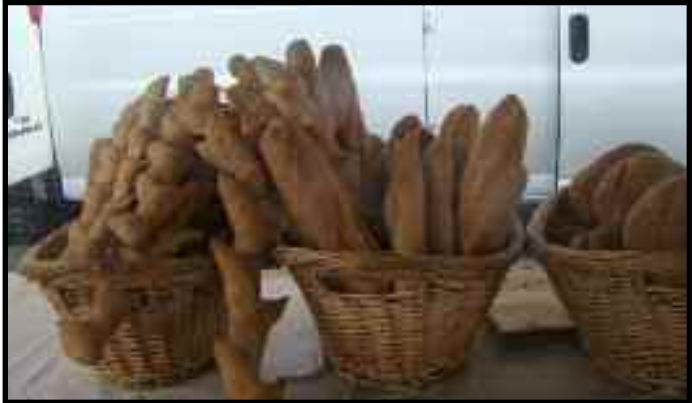
#10 Deadline April 15, 2022