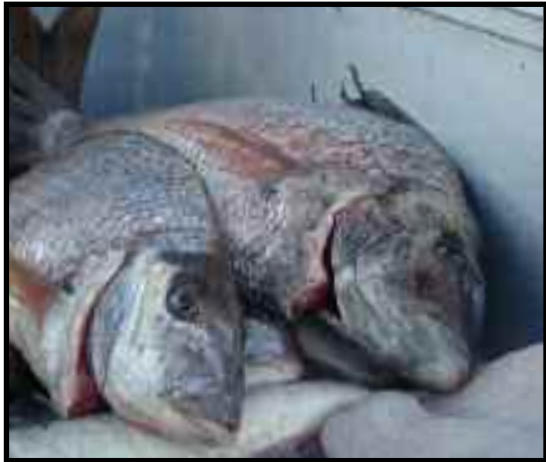
#9 Deadline March 15, 2022