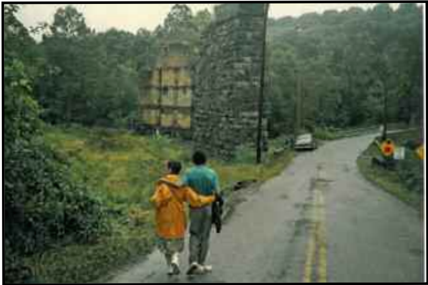
#11 Deadline May 15, 2022