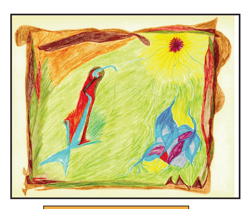
#11 Deadline May 15, 2014

Mail hard copy submissions, with a self addressed, stamped envelope (if you want your work returned), to Ten Penny Players, Inc. 393 St. Pauls Avenue Staten Island, NY, 10304-2127 Subscriptions to Waterways are $45 for eleven issues; $5.00 for a sample issue. Checks should be mailed to Ten Penny Players, Inc. at the above address.